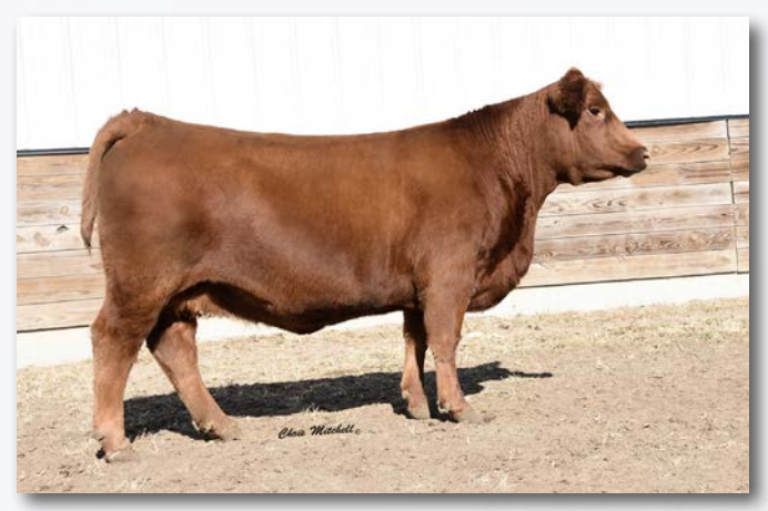
DCH G406 Pick of 2020 Chimney Butte Ranch Open Heifers

Thank you to Chimney Butte Ranch for donating pick of 2022 open heifers to the North Dakota Gelbvieh Association for our 2023 fundraiser. The continued support of the North Dakota Gelbvieh Association is appreciated.