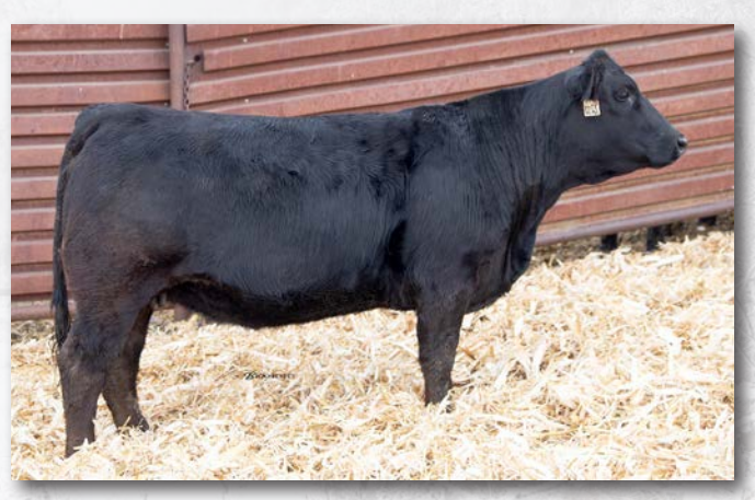
HPW 120J Sells as lot 6