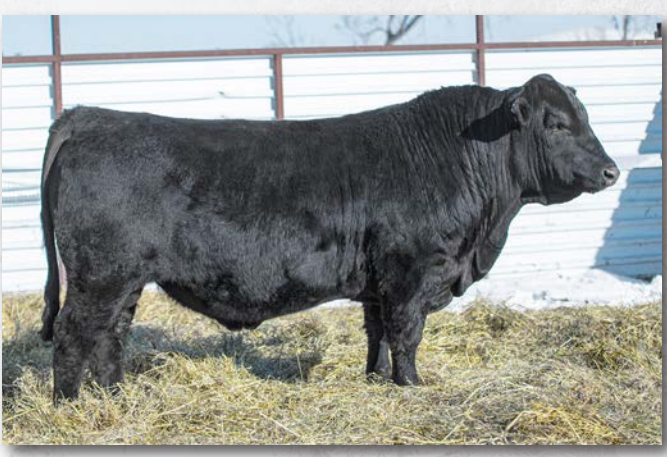
WOHL Pas D'Exageration J261 Sells as lot 21