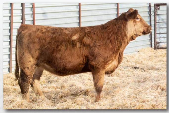
HOOT J101 Sells as lot 9