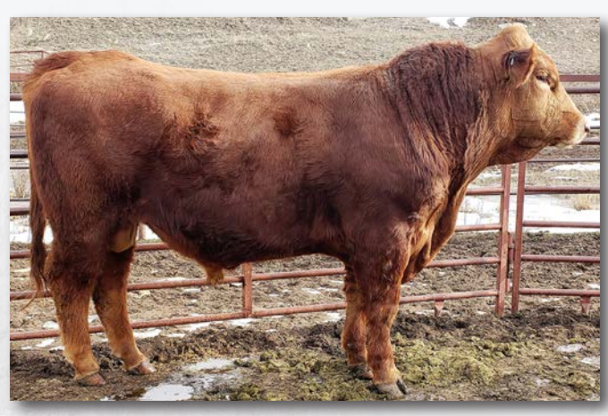
JMR Jacob JMR 103J Sells as lot 24