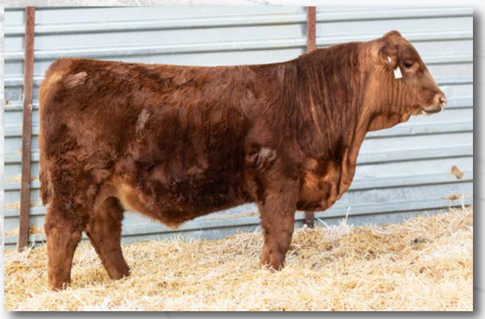
JEN K137 Sells as lot 33