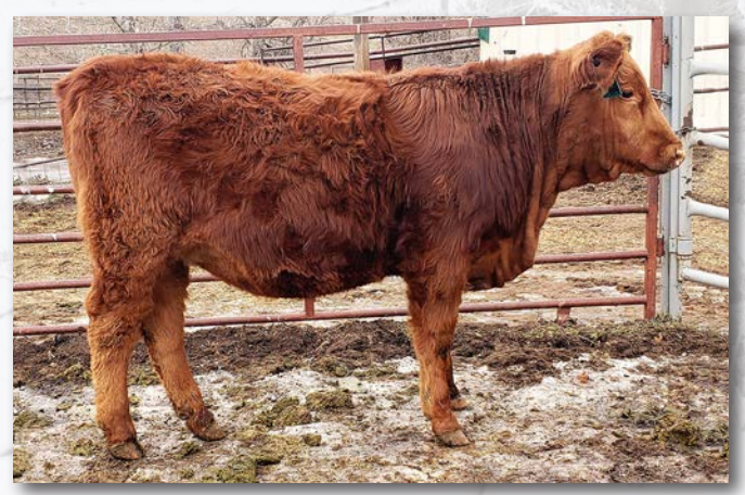
JMR Kelsey JMR 237K Sells as lot 15