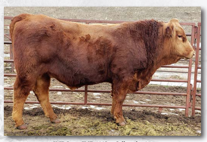
JMR Jayce JMR 128J Sells as lot 25