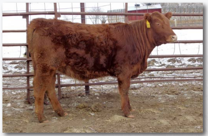
KHR 202K Sells as lot 13