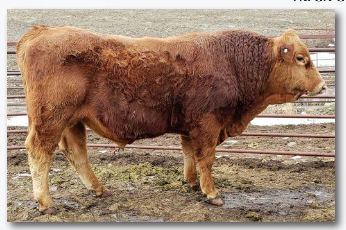
JMR Juelz JMR 127J Sells as lot 26