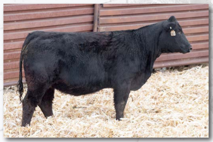
HPW 130J Sells as lot 7