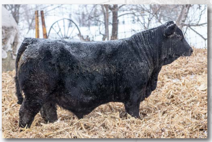
CMK K30 Sells as lot 29