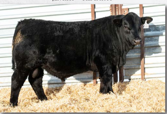
JEN K111 Sells as lot 32