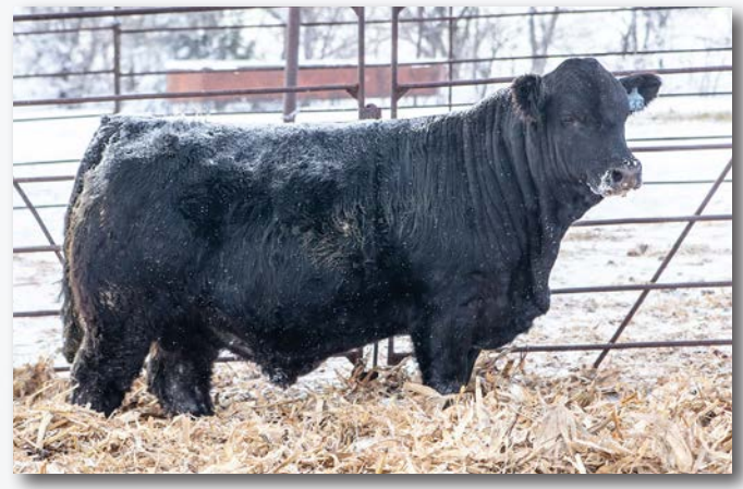
CMK K33 Sells as lot 30

JEN K137 is a really deep red bull that can be a cool breeding piece. His sire is RWG GUILT TRIP 9418 ET, we bought a semen package on this bull and he has made some pretty neat offspring. K137 is the first bull out of the 12 year old dam JORD Y12. This is a really good female that we have retained several daughters and granddaughters in our program.