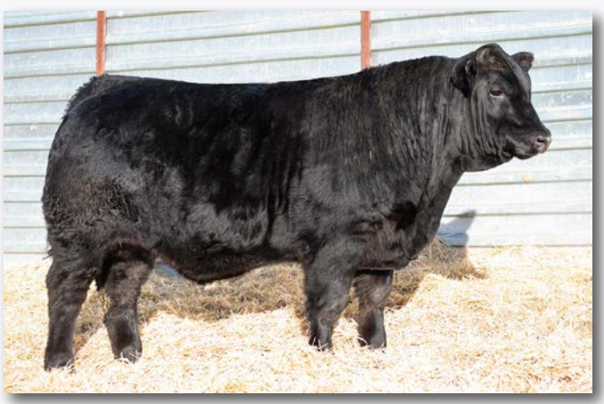
JEN K117 ET Sells as lot 19