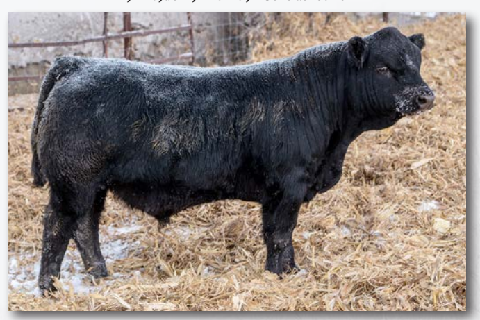
CMK K13 Sells as lot 27