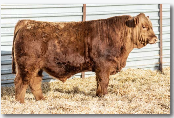
JEN K139 Sells as lot 20