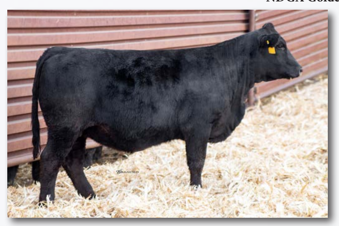
DDGR Anna 28J Sells as lot 4