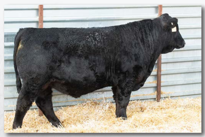
JEN K116 Sells as lot 31