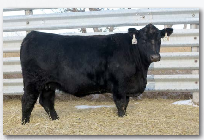
DDGR Jocelyn 266J Sells as lot 2