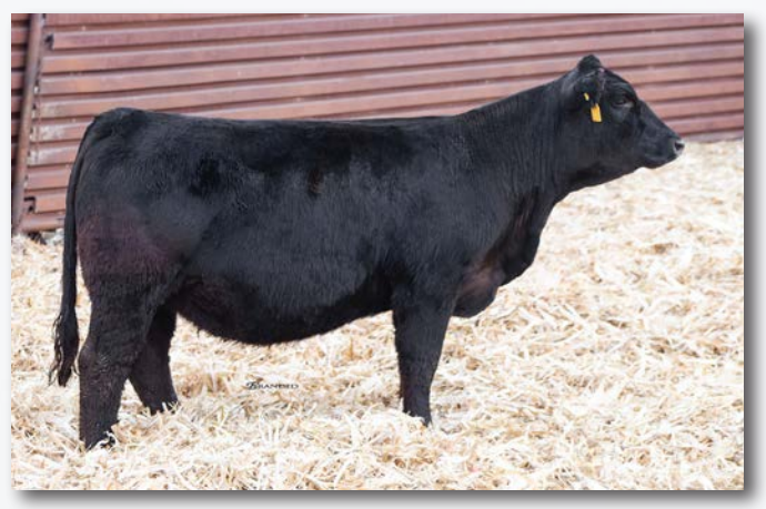
DDGR Fiona 172J Sells as lot 8

JUDY JMR 149J an exceptionally well-built 94% purebred FELIX JMR 825F daughter, out of 3-time Dam Of Merit female EMMA JMR 739E. EPD numbers where you need them; calving ease, performance, milk, fertility, and carcass quality traits. HP/SC top 2% CED/BW top 15% Milk/CEM/DOC /CW & CFAT in the top 40% of the breed. Her confirmation, expected udder structure, docility, & genetic makeup should make an excellent mother cow just like her dam. JUDY is growing a JOHN JMR 129J heifer calf due to arrive April 10th. GGP- 100K DNA tests pending should be back prior to sale day.