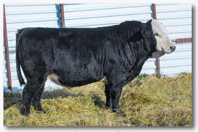
WOHL Edgar JBW3 Sells as lot 23

the EPD numbers to positively impact your herd. Outcross genetics. EPD rankings HP / DOC / & SC Top 2%. CED/ BW/Milk/& CW top 25% Cover your cows with this powerhouse bull and the offspring will produce the profit margins you are looking for calve easy, grow fast, fertility, docility, & carcass. Tenderness score of 7