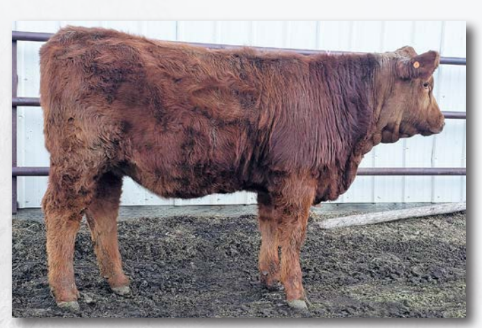
JMR Kenzie JMR 242K Sells as lot 17

KENZIE JMR 242K is the kind of feminine heifer you build your dreams around – progeny and show ring potential powerhouse; A 99% Purebred dark red exceptionally built KHR TAYLOR MADE 85D heifer. She is out of ELEANOR JMR 756E who has raised some exceptional offspring for us. KENZIE has exceptional EPDs to complement her confirmation and eye appeal. She is in the top 5% in CED/Milk/CEM/SC & CFAT in and the top 25% BW/TM/HP/STAY/DMI/YG/RFI/$COW KENZIE has all the elements to become the cornerstone to build or improve your herd. We went deep into our replacement heifers to select her for this great ND Gelbvieh sale. Calving Ease, Performance, Fertility, & Carcass wrapped into one exquisite looking maternal female. Buy her now or get beat by her later. GGP- 100K DNA tests pending should be back prior to sale day.