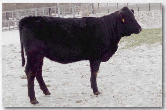
KHR 245K Sells as lot 14