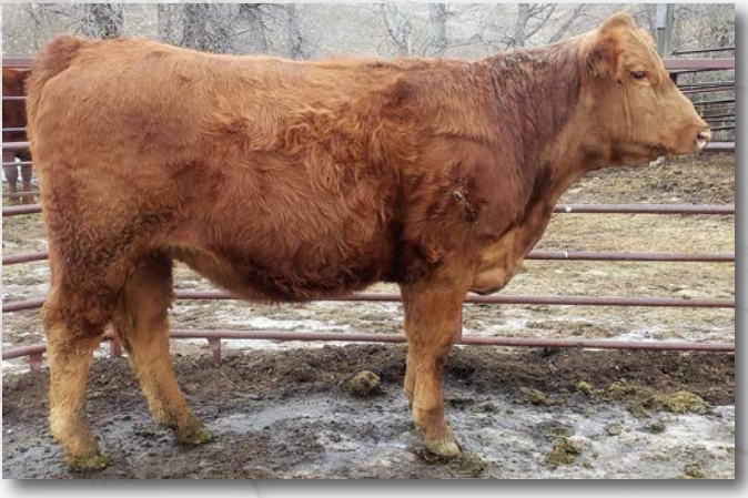
JMR Judy JMR 149J Sells as lot 11