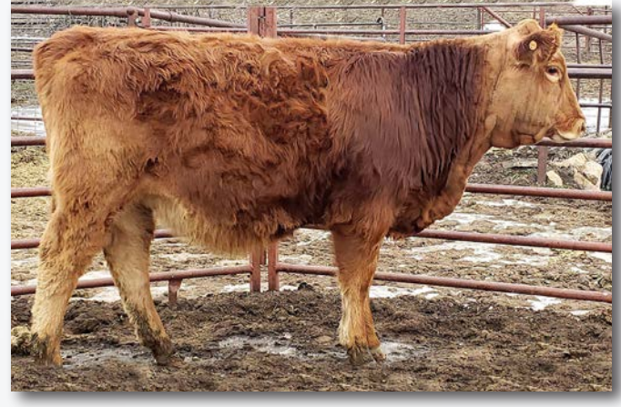
JMR Kandy JMR 238K Sells as lot 16

KANDY JMR 238K is a 94% Purebred deep bodied feminine WRANGLER 023W daughter out of a Dam Of Merit female FALLON JMR 862F from our great 3-Time Dam of Distinction YVETTE JMR 108Y cow family,. We have many YVETTE daughters, granddaughters, great granddaughters in our herd many with 10 for tenderness. We have been very excited to watch KANDY develop into the powerhouse female she is becoming, with 11 EPD traits in the Top 45% of the breed; Milk & CW Top 4% CED/BW/TM/DOC/SC/CREA/CFAT Top 25% WW & PG30 TOP 45%. Easy calving, Performance, Milk, Total Maternal, Fertility, Docility & Carcass traits where all cattlemen desire them. GGP- 100K DNA tests pending should be back prior to sale day.