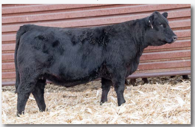
CMR 61J Sells as lot 5