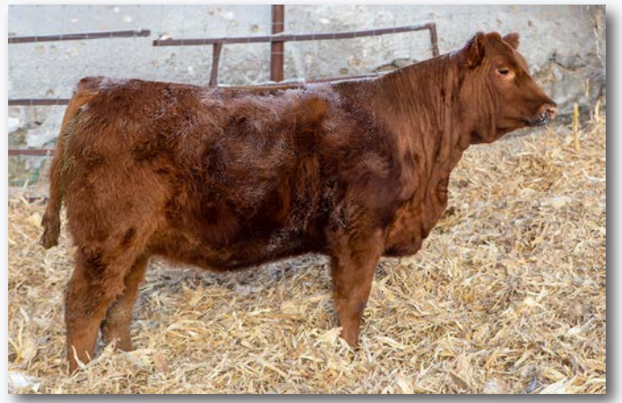
CMK K21 Sells as lot 12