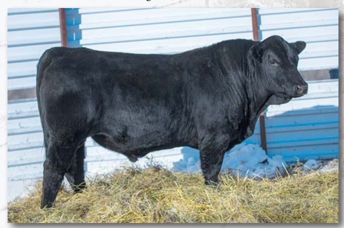
WOHL Metadata J9010 Sells as lot 22

JEN K117 E1 %GGP PB 87.5% Gelbvieh Bull Heterozygous Black JEN K117 AMGV1538714 3/14/22 BW: ET WW: 687