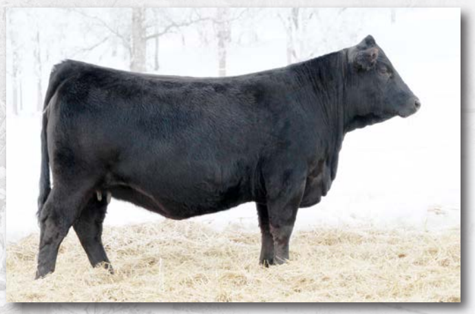
LRSF Arianna J190 Sells as lot 3