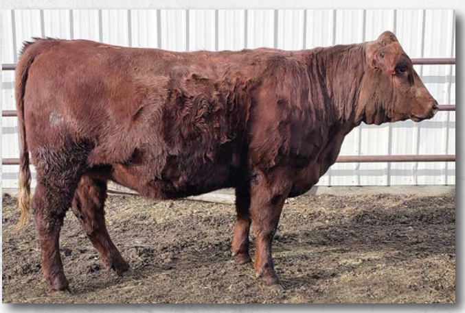
JMR Julia JMR 148J Sells as lot 10