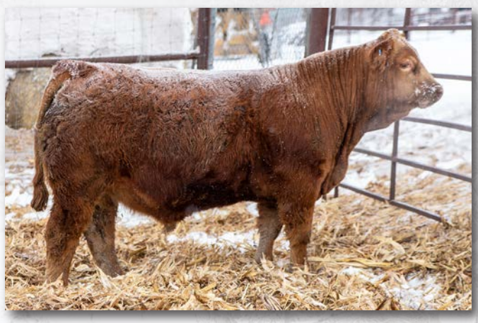
CMK K17 Sells as lot 28