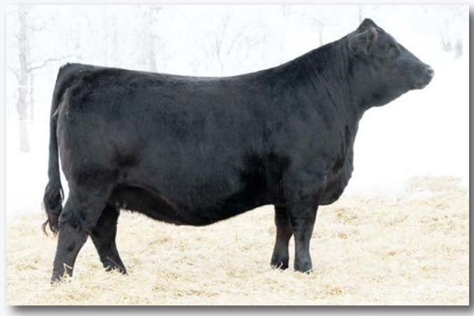
LRL Rylee J66 Sells as lot 1

LRSF Arianna J190 is a very long spined and attractive purebred Gelbvieh female tracing back to our 77B donor purchased from Gustin's Diamond D as the pick of their open heifers in 2015. The 77B cow has been a consistent producer for us and longtime member of our donor battery landing numerous progeny in seedstock herds across the country. Arianna J190 is also part of the first group of Frontrunner daughters to calve and the excitement around these females is tremendous. This gal maintains outstanding EPD strength with top 15% CED, 35% BW, 40% STAY , 10% REA, 20% MARB and 30% \, FPI. Arianna J190 was Al bred on May 7, 2022 to Tehama Patriarch F028, the lead-off Angus bull in the ABS lineup and sells ultrasound confirmed safe to her Al date, due February 14, 2023 carrying a heifer calf with absolutely barn-burning figures led by top 10% CED, 35% WW, 15% YW, 10% REA, 15%